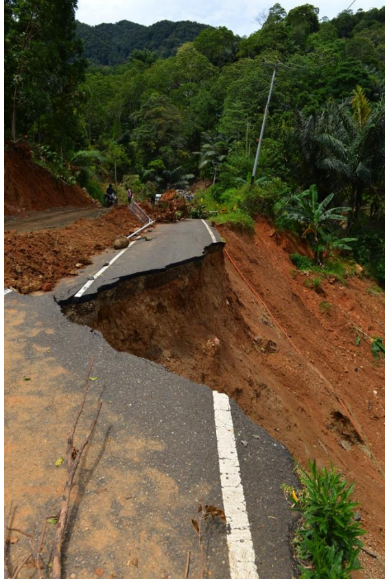
Cancar to Labuanbajo road with major slips