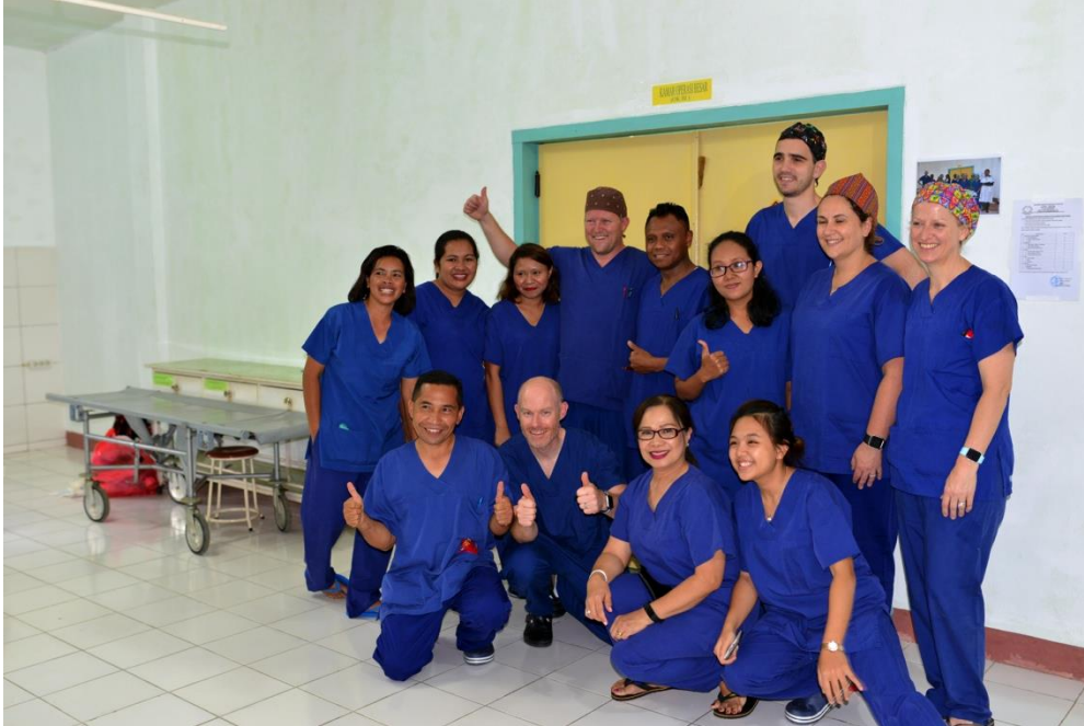
OSSAA team with local counterpart operating theatre staff at weeks end