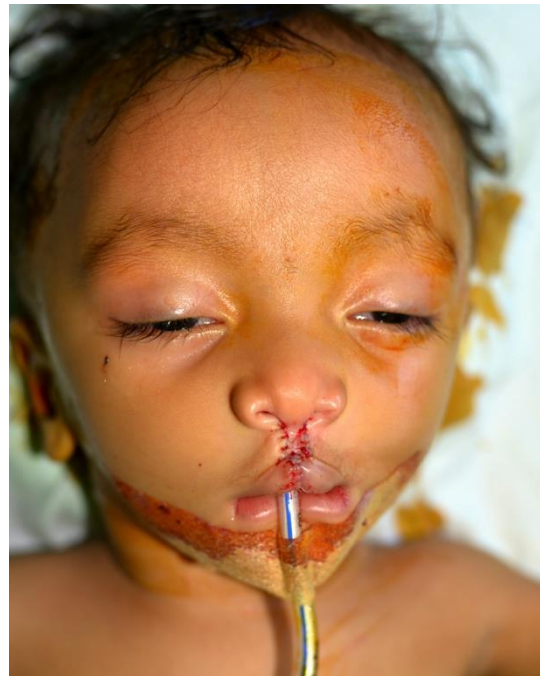
7 month old with bilateral cleft and palate infant undergoing primary cleft lip repair