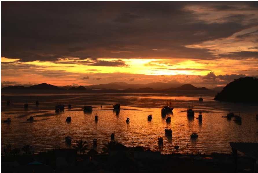
Sunset in Labuanbajo, Flores