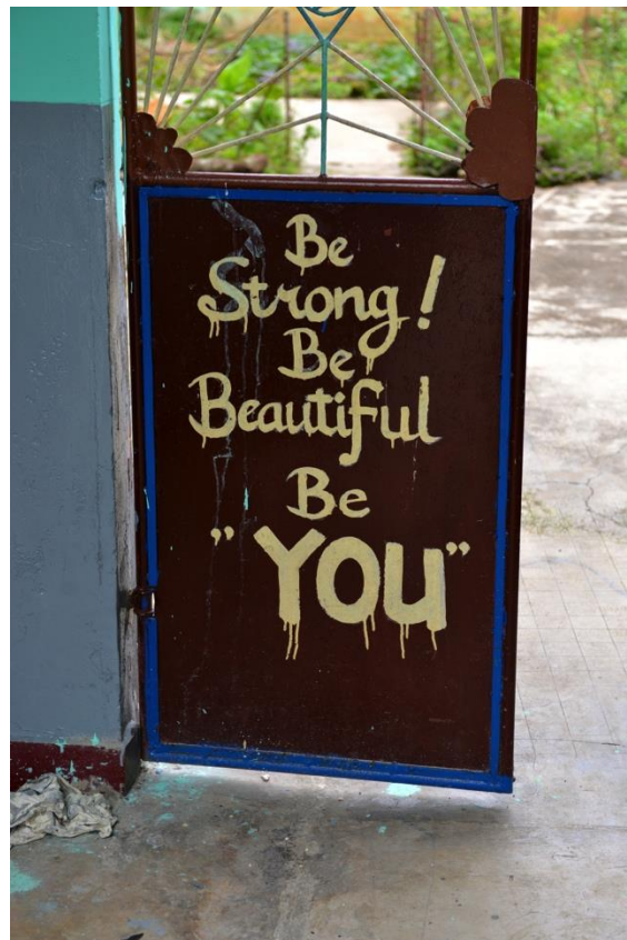
More inspirational Cancar 'graffiti