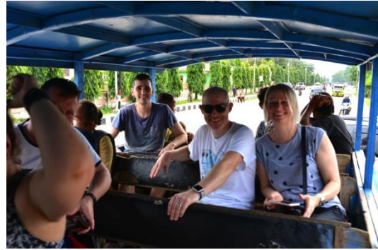
The OSSAA team travelling by truck from Labuanbajo to Cancar