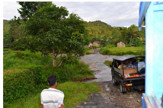
Road washouts and challenges en route to Cancar