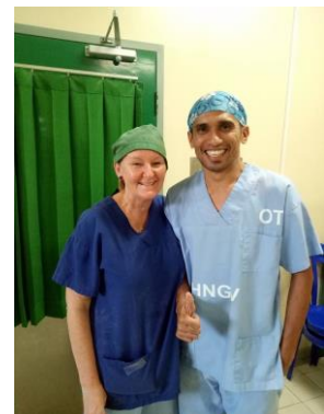
Joy and Mok in theatre

Through clinical support and role modelling I try to equip nurses with the skills to educate their own junior staff. As the junior nurses grow to be more experienced, they themselves will be equipped to teach their juniors , thus