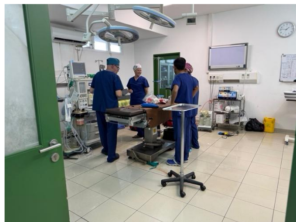
HoREX walkways and operating theatre