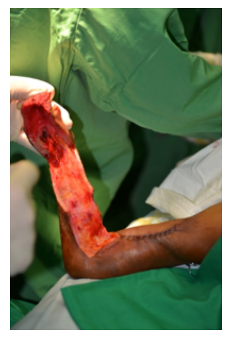
2014 – at first presentation, with burn contracture