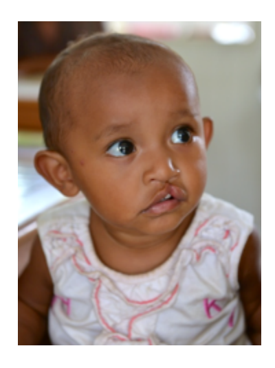
Unilateral cleft lip repair in 2013 , followed- up in 2015