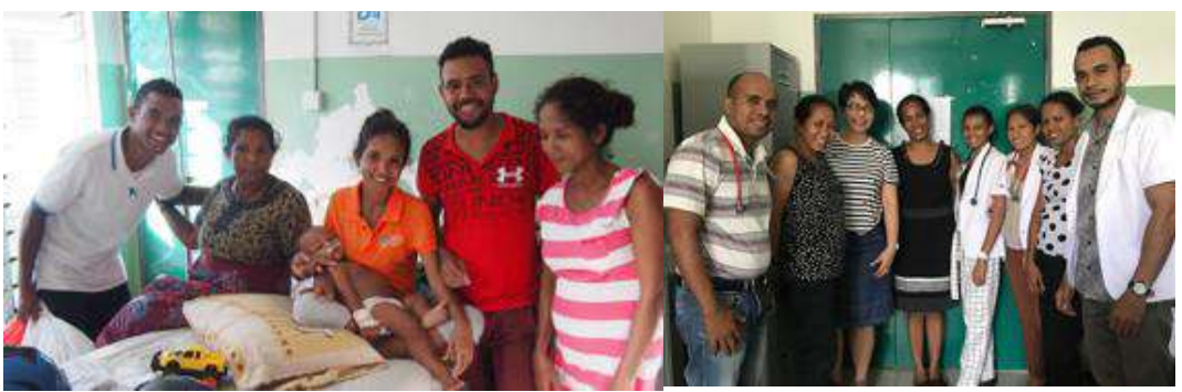
Family gathering post lip repair