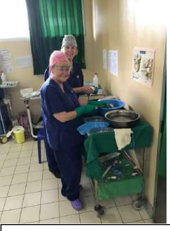
Decontaminating airway equipment