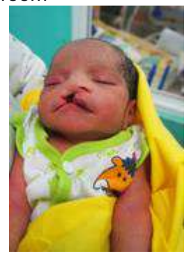
3 day old boy with cleft lip and palate