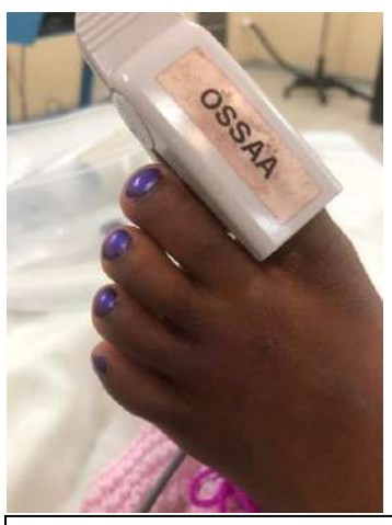
Whilst waiting for surgery nail polish was well utilised